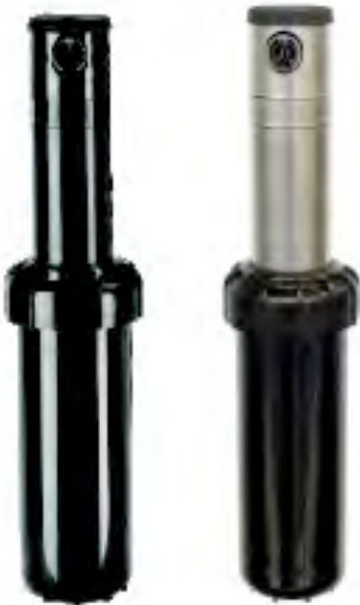
2007 Toro TR50 Sprinkler