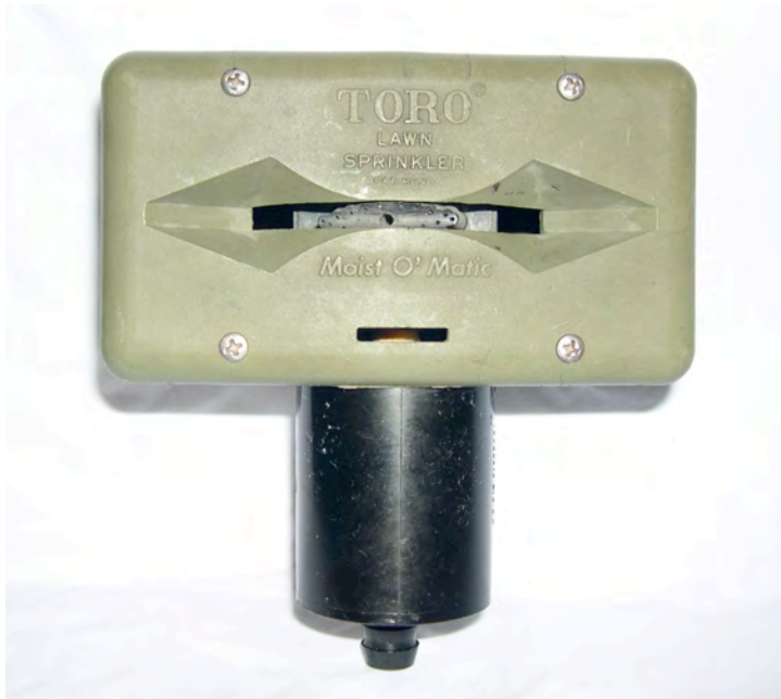
1967 Toro Wave Sprinkler